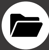
Records & Mail